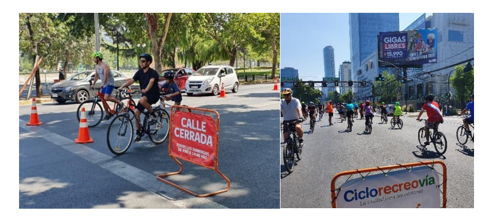
Car-free Sundays bring together thousands of cyclists

Art Bike points here to the rapid increase in the number of bicycle accidents recently. This is due both to unaccustomed cyclists in general and, according to Art Bike, specifically to the fast-growing loan bike market, which they believe leads to reduced road safety. "Anyone who gets their own bike makes an important investment and a conscious decision. Anyone who rents a bike or scooter takes no responsibility and does not get involved. Knowledge of the rules is low, and almost none of those who use the bicycles are wearing helmets."<sup>26</sup>