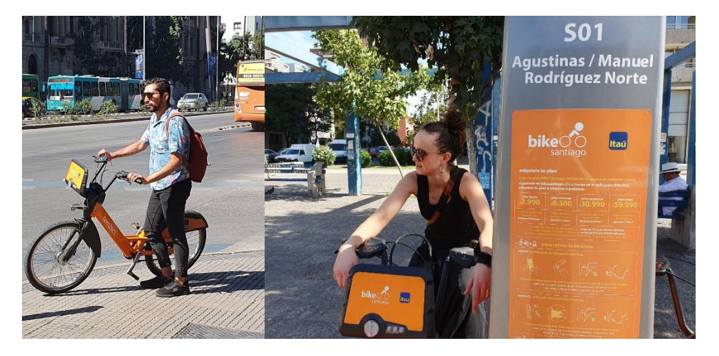
Bicycles in Santiago - theft-attractive possibility of increased cycling

Several operators offer bicycles with both fixed and floating systems. Rapid expansion is made more difficult by the fact that it is municipal regulations that determine whether or not to establish ones. This means, for example, that the European Union should be able to take account of the electric scooters are not in principle taken over the municipal border, which, not least in Santiago with its many municipalities, is a clear restriction. The bikes have also been the victims of many thefts.