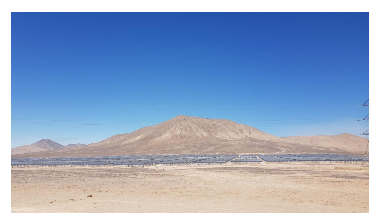
Solar park in the Atacama Desert, an important part of Chile's transition to renewable electricity and climate neutrality

At this point (May 2020), the Chilean Senate is considering the draft climate law <sup>7</sup>, with a decision likely to be made before the end of the year. <sup>8</sup> In addition to the final year, the law contains processes for deciding on interim targets for 2030 and 2040 and sectoral climate budgets, as well as a process for the development of regional climate plans. Climate adaptation processes are developed by sector, e.g. for biodiversity, infrastructure, mining, the energy sector and the health sector. A special Council of Ministers on Climate Change is set up, chaired by the Ministry of the Environment, and a special fund to support citizens' initiatives in the field of climate change is set up. Every four years, the overall climate work will be evaluated in a government-run RANCC (Reporte de Acción Nacional de Cambio Climático). Separately from this, an independent scientific council is established with nine experts to assess the overall climate work, in line with the Swedish Climate Policy Council.